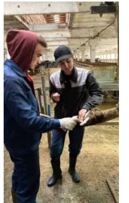
Diagnosis of lameness and cleaning of hooves. Organization and implementation of treatment and preventive measures for finger diseases.